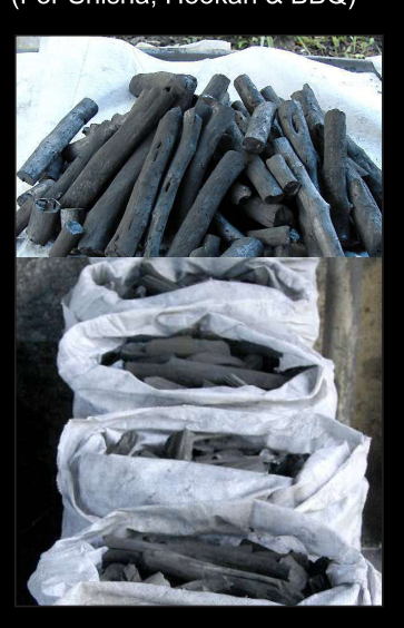
%100 Marabu (For Shisha, Hookah & BBQ)